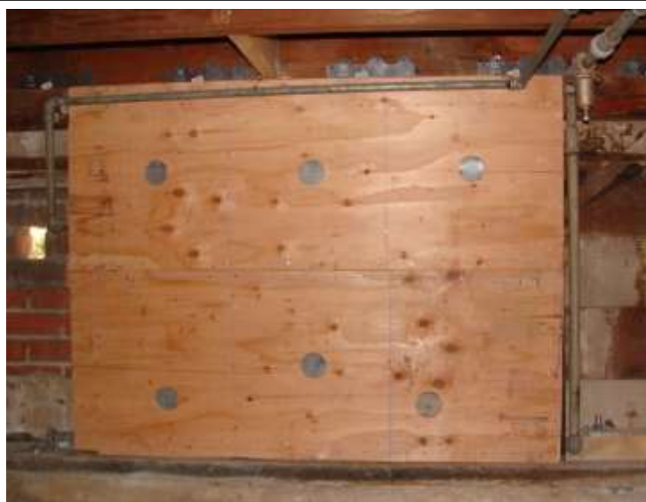
Figure 3-7 Plywood bracing panels nailed along all edges. Note the horizontal joint with nailing above and below the joint. The six holes provide ventilation to help prevent moisture build-up and associated damage

A properly installed plywood bracing panel must be securely nailed to solid framing at all edges, as shown in Figure 3-7 . Any seams in the panel—such as the horizontal one here—must have framing installed behind them so that all panel edges can be securely nailed. (Plywood comes in 4-foot widths, but you may have to cut narrower strips in order to fit them into the work area.)