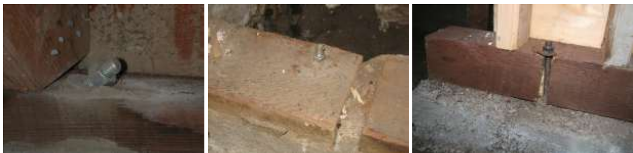
Figure 3-6 These photos show several examples of bad anchor bolt installations: Left: Retrofit bolt installed at an angle; Center: Bolt that is too small, installed without a proper washer and too close to the end of the mudsill; Right: Mudsill slotted to install in the course of repairing decay or pest damage.

Faulty pest repair work: The section of mudsill shown below right was installed as a repair on a foundation where bolts were already present. Since the house could not be lifted to permit dropping the new mudsill over the bolts, the installers cut slots into the sill so they could slide it in sideways. The slot substantially weakens the mudsill. Also, the bolt is probably not embedded deeply enough in the concrete, and it lacks an adequate washer. This installation would not meet any code, whether it is supposed to resist earthquake forces or not.