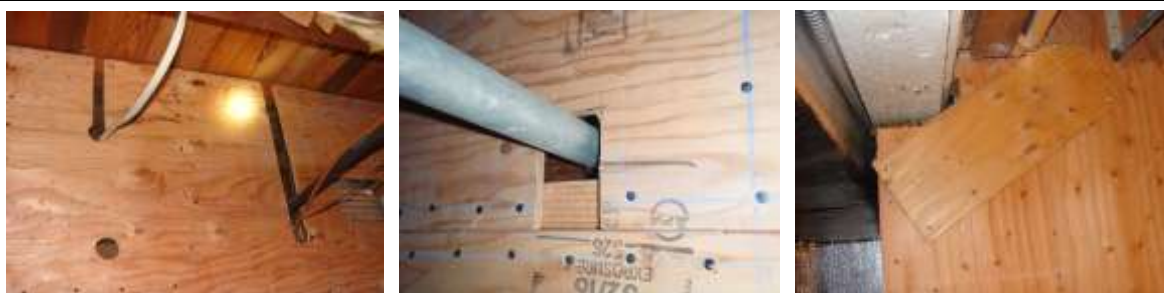
Figure 3-13 Slots severely weaken plywood bracing panels. If existing utilities cannot be avoided, slot length should be minimized (center) or a plywood patch glued to the plywood to reinforce it.

Repairing notches or slots: In a perfect world, nothing would obstruct the plywood installation. In reality, avoiding obstructions is often impractical or adds great expense to the work. Slotted shear panels can be strengthened by gluing plywood patches over the slots, as shown in the right-hand photo in Figure 3-13 . (Plywood is manufactured by gluing wood veneer together; it can be patched the same way.) The screws in the photo are only there to hold the repair patch in place until the glue dries. Repairs require proper plywood and adhesives.