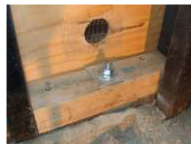
Figure 3-9 Mudsill block with proper attachment to foundation and mudsill. TM-RDW

It is all too common to find bracing that is not properly installed. The most common defects are the use of screws where nails are needed, missing or improperly installed nails, inadequate blocking at the mudsills, and gaps in bracing panels.