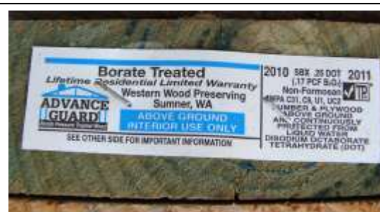
Figure 4-7 Borate treated lumber is not toxic to humans, and does not increase corrosion in fasteners like other chemicals.

RECOMMENDATIONS: There are two simple solutions to the corrosion problem. The first is to use stainless steel framing connectors; these are very expensive. The better alternative is to use BORATE TREATED lumber. Borate treatments are not waterproof, and must not be used for decks, fenceposts, or other members exposed to liquid water—but borate-treated lumber is appropriate for mudsills and other members that are protected from weather.