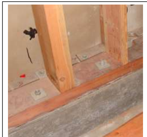
Figure 3-1 Mudsill connection to the foundation in a house under construction. This crucial connection transfers earthquake forces to the foundation.

The vertical “studs” will support the wall surfaces and the structure above.