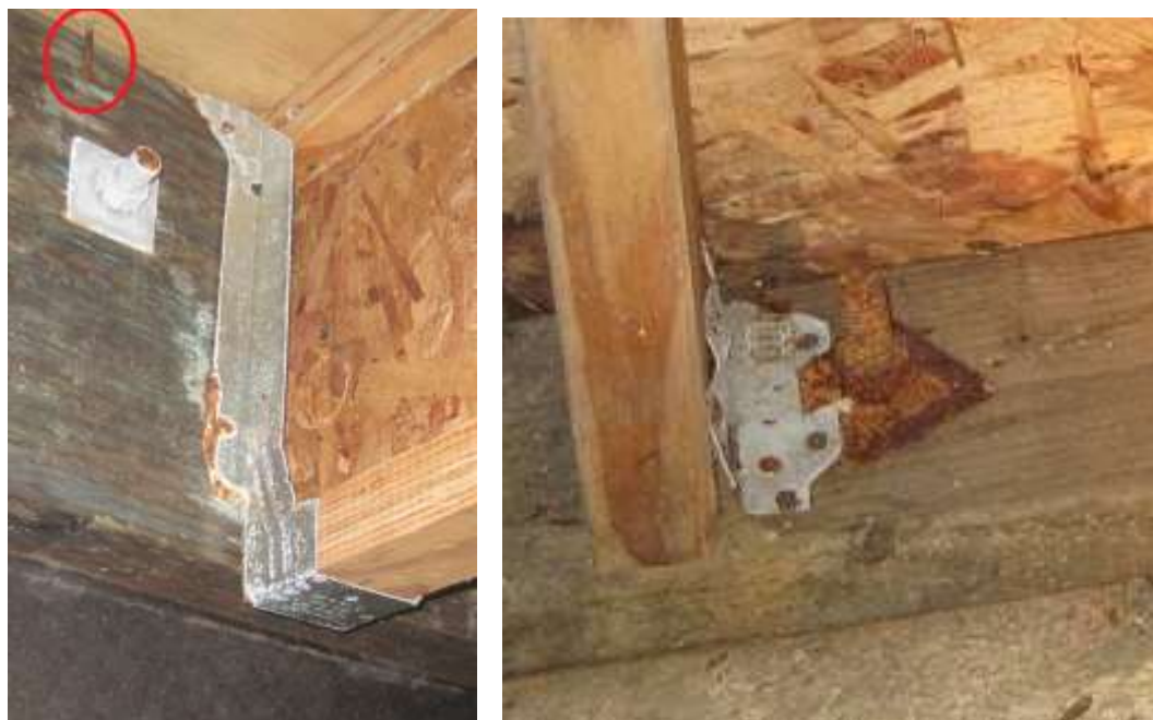
Figure 4-6 Corroding steel and galvanized steel connectors.

Left—note the nail in the red circle, that is corroding where it barely touches the PT lumber. There is a moisture barrier between the PT lumber and the concrete footing; without the barrier, corrosion would proceed even faster. This photo was taken just four years after construction. Note also that the silver-gray, galvanized steel hardware is beginning to corrode; corrosion will continue until all of the galvanized coating—and then all of the steel—is consumed. The steel rusts over its entire surface—not just where it contacts the wood.