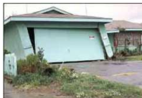
Figure 4-1 Typical “SWOF” construction (top photo) and damage.