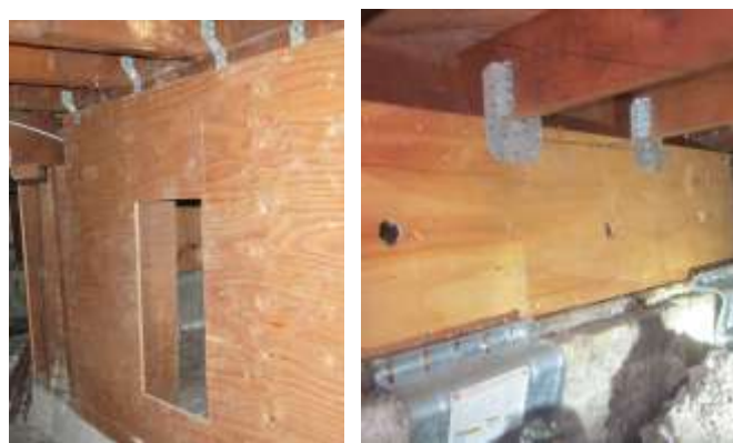
Figure 3-15 “Hurricane Ties” used to connect floor framing. The connectors in the left-hand photo have almost no capacity to resist side-to-side earthquake forces. The connectors in the right-hand photo have a much greater load rating.

The connectors at the top of the wall in the right-hand photo are also “hurricane ties”, but they connect to both sides of the joist and have a much higher rating for side-to-side forces. When this sort of connector is used, blocking between the joists is essential.