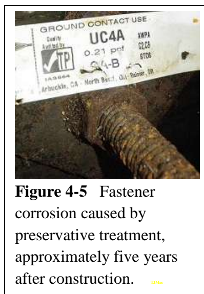
Figure 4-5 Fastener corrosion caused by preservative treatment, approximately five years after construction.

Corrosion can cause structural connections to fail. In the case of bolts or other anchors, failure could allow the structure to slide off the foundation in an earthquake. Corrosion of nails in shear panels or exterior sheathing could result in total failure of wall bracing. The severity of the problem varies with the specific formulation, the type of hardware installed, moisture conditions, and other factors. Because this is a relatively recent development, the potential for failure is still uncertain—but based on reports from contractors and field observations, the outlook is not good. Anchors and nails are usually concealed in a completed building, so it can be difficult to evaluate the extent of damage.