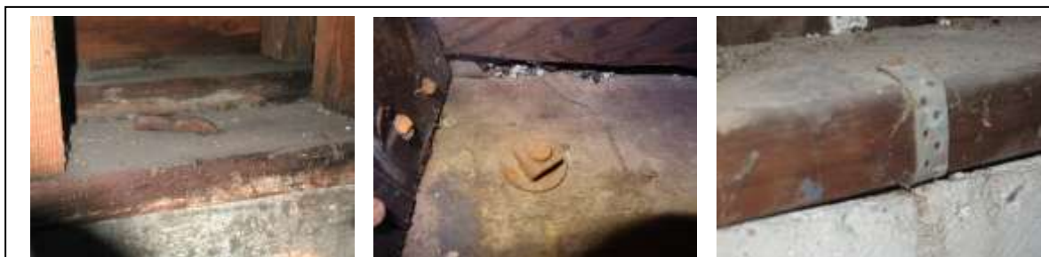
Figure 3-2 Mudsill connections used in the past. From left to right: Steel rod, pin, or bolt bent down over mudsill; bolt with standard round washer and nut; proprietary sheet-metal strap embedded in concrete and wrapped around and nailed to mudsill.

Anchor bolt used from about 1950 through about 1995. The bolt shown in Figure 3-2 is typical of the era when bolts were first widely installed. It is smaller ( \frac{1}{2} " diameter) than bolts used in current construction and it lacks the large square washer or "bearing plate" needed to help ensure the mudsill will not split during earthquake loading. Older bolts like this often do not extend far enough into the concrete foundation, and may be partially rusted through.