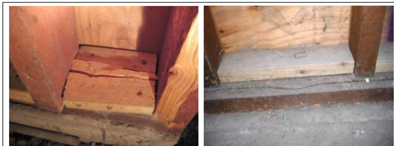
Figure 3-12 Mudsill block problems: Left—Split block; Right—lack of visible connection from block to mudsill. TM—Paul Rude