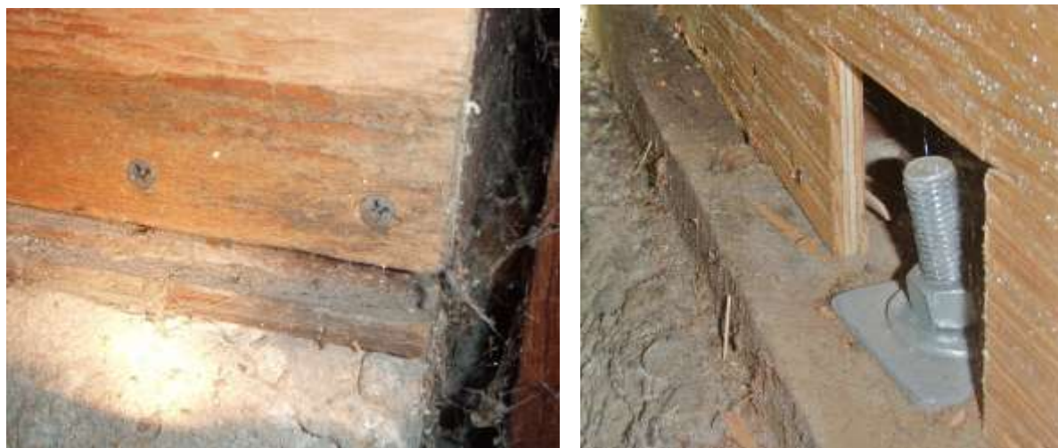
Figure 3-10 Defective plywood connections: Left—drywall screws; Right—toe-nails along bottom edge of plywood into the mudsill. TM-RDW, Mar C

Nails too close to plywood edges: Nails must be installed at least 3/8" away from the panel edges, and preferably further. Nails that are too close to the edges can tear out of the plywood during an earthquake. In the right-hand photo in Figure 3-10, the bottom edge of the plywood is "toe-nailed" to the mudsill, which is an especially poor connection.