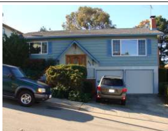
Figure 2-3 Mixed foundation systems. This house has a lower-level garage on the right with full-height wood-framed walls, and a crawlspace on the left with no cripple walls. Other weaknesses include a split-level floor at the entry, and a “weak-story” at the garage. Another hazard is the brick chimney. All of these are special cases beyond the scope of this document.