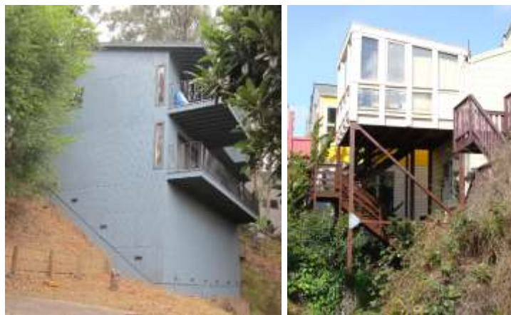
Figure 5-1 Hillside homes require special consideration; plywood shear walls perform badly in sloping walls as found in the house shown above left. Homes on steep sites can be very dangerous in quakes.

Figure 5-1 shows two typical hillside homes, one supported by a perimeter foundation and another supported on tall posts. Both of these homes need special bracing measures. Plywood bracing does not work well on sloped or stepped foundations, even if it is installed following the recommendations given earlier.