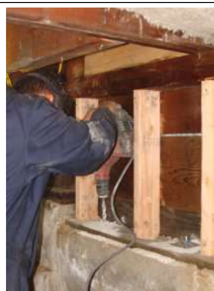
Figure 3-3 Retrofit bolt installation at a cripple wall.

Bolts can be secured into the concrete with epoxy resin or other adhesives; other anchors (described in some of the references under Further Information) are also effective.