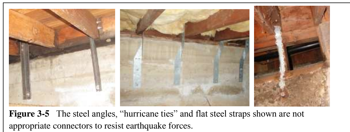
Figure 3-5 The steel angles, “hurricane ties” and flat steel straps shown are not appropriate connectors to resist earthquake forces.

“Hurricane ties:” Sheet metal anchors as shown in the middle below are designed for resisting upward loads; they have very little resistance to the side-to-side forces of an earthquake. Unfortunately, they are fairly common, especially in retrofits from the 1990s, before more appropriate hardware was widely available. The best approach is usually to leave these in place and install anchors designed for the situation, such as the UFPs shown above.