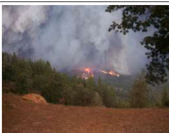
Figure 7-1 Wild-fires are scary enough without the extra confusion of an earthquake. Plan your escape now!