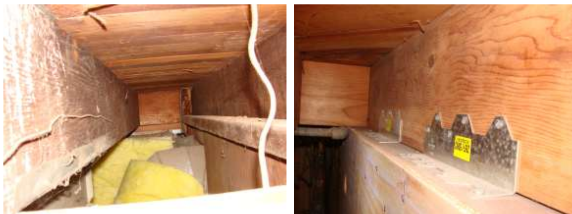
Figure 3-14 Connections from floor framing to the braced walls.

Floor framing connections to braced walls: The floor joist at the right side of the photos below (resting on top of the cripple-wall top plate) was typically only connected with a few “toenails” which provide very little strength to keep it from sliding along the top of the braced wall. The photos in Figure 3-14 show joists before and after proper connections were made. Special tools are almost always needed to drive nails in such restricted areas.