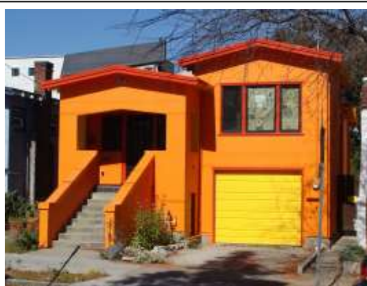
Figure 2-1 Typical house with cripple walls.

Cripple-wall house: Figure 2-1 shows a wood-framed house supported on a perimeter foundation with a crawl space or basement below the first floor, and cripple walls between the foundation and floor. A majority of homes built before 1950 are in this category and this type of construction is still common. The difficulty and cost of an upgrade is affected by the degree of access below the floor. Where clearance