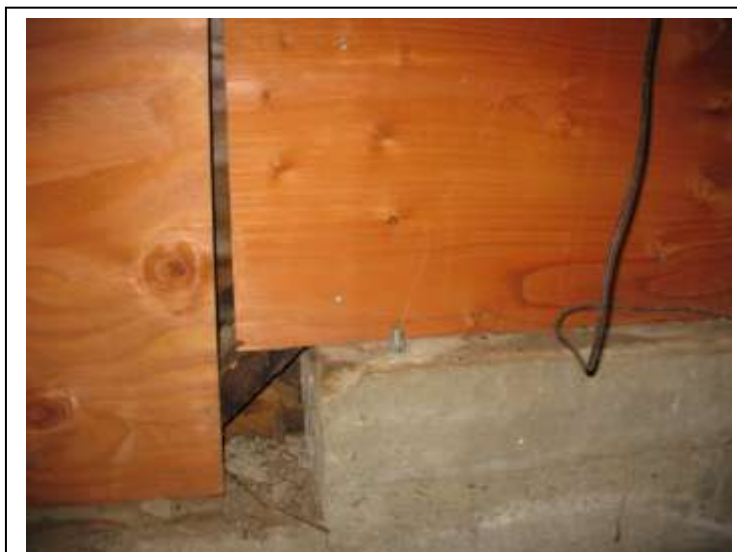
Figure 3-11 Plywood must be nailed to framing along each panel edge. TM—Max CamoW

Lack of secure block connection: In the right-hand photo in Figure 3-12 no nails are visible in the block, indicating that it is not properly attached to the mudsill. Nails may have been driven into the ends of the block through the studs, but such a connection is much weaker than nailing directly to the mudsill.