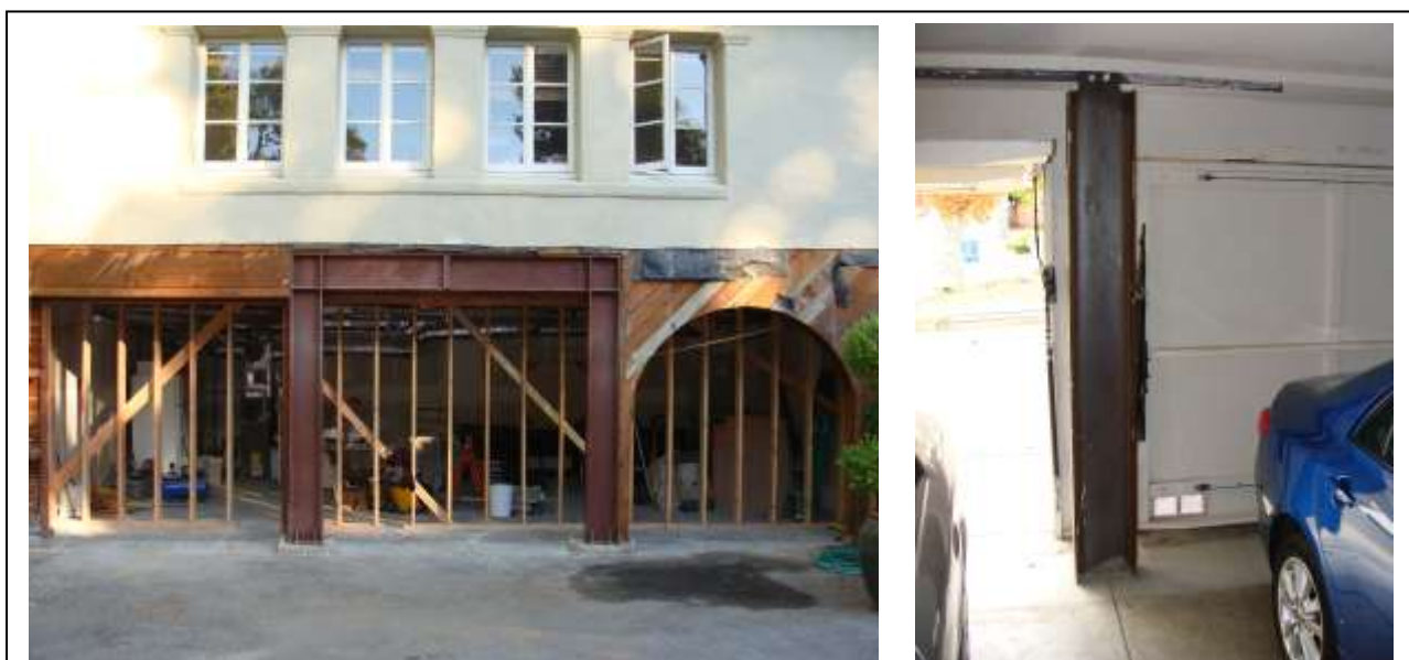
Figure 4-2 Two ways to strengthen a soft-story.

Installation costs for both systems depend on the height of the opening, weight of structure above, the orientation of the floor framing members above the garage, existing obstructions, and other factors. Strengthening a soft-story is an expensive solution using the methods currently available. One of the authors of this document is pursuing a method that would allow lighter-weight moment columns, with related reduction in foundation size.