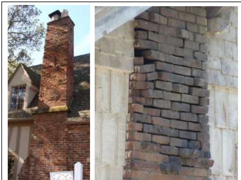
Figure 4-8 Chimneys are hazardous even when they are in good condition. Slamming the front door could cause the disintegrating chimney shown at right to collapse.

Masonry chimneys are very vulnerable to earthquakes; collapse can result in death or serious injury. Figure 4-8 shows two dangerous chimneys. The safest approach is to have chimneys removed, at least down to the level of the mantle. Where a fireplace must be retained, a metal flue can be installed. Steel braces may reduce the hazard, but most existing braces are inadequate. Bracing that meets current codes is extremely expensive to design and install; even braced chimneys may shed individual bricks in a strong quake.