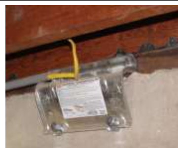
Figure 3-4 A Simpson “UFP10” used where bolt holes could not be drilled from above (yellow electrical cable and gray conduit to left are not related to the connector).

Mudsill connectors for low-clearance installation: Where there is not enough room for drilling from above, standard bolts will not work. Several types of connectors are available that can be secured to the side of the foundation with bolts into the concrete and structural screws into the edge of the mudsill. Figure 3-4 shows a “Universal foundation Plate” (UFP10) manufactured by Simpson Strong-Tie Company. This hardware is specifically engineered for this situation, and has undergone testing to establish its load capacity.