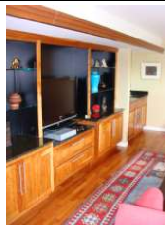
Figure 5-2 Installing earthquake strengthening measures will help protect your basement remodel, as well as the rest of your house.

The newly remodeled basement shown in Figure 5-2 has lovely cabinets and finishes—but is there plywood behind the freshly-painted walls? Were any mudsill anchors installed? What design guidelines, if any, were followed in designing the retrofit strengthening work?