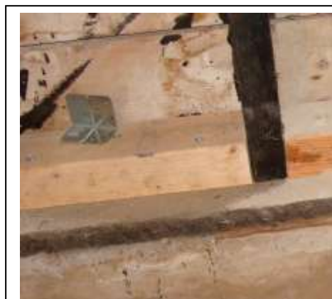
Figure 3-8 Mudsill blocks connected with structural screws.

Screw connections: The block shown in Figure 3-8 is connected to the mudsill with special screws. This provides a solid connection that also keeps the block from lifting off the mudsill. (Lifting results from the bracing panel rocking back and forth, not from vertical earthquake forces.)