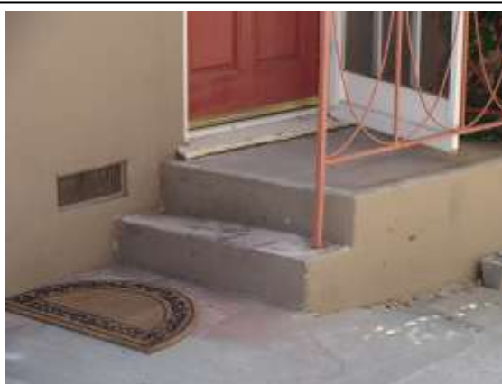
Figure 2-2 Typical house with crawl space and NO cripple walls. If there are foundation vents around your house but it only has one or two steps up to the main floor level, it probably does not have cripple walls.

Composite Buildings: Many houses, especially those on hillsides, have more than one style of construction, either due to site conditions or to additions after original construction. The house shown in Figure 2-3 has a slab foundation on one side and full-height concrete block walls on the other.